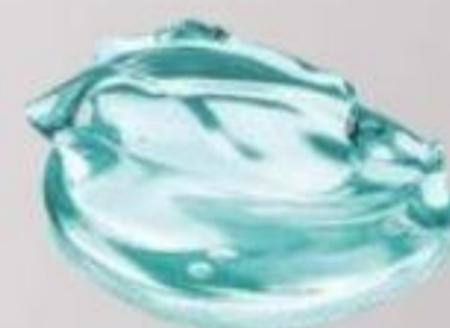
Monophasic, smooth colourless gel